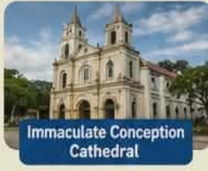
Immaculate Conception Cathedral