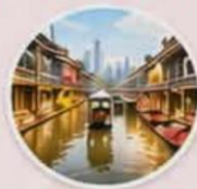
SONG WAT ROAD